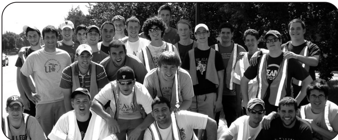
AT TEXAS A&M, the growing Gamma Kappa chapter poses on its adopted street in College Station, TX; the chapter copped 6 awards at the 2007 Convention. In the A&M fraternity system, it is #1 scholastically.