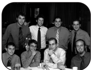
ARIZONA STATE Gamma Phi delegates at the Convention in Phoenix last year.