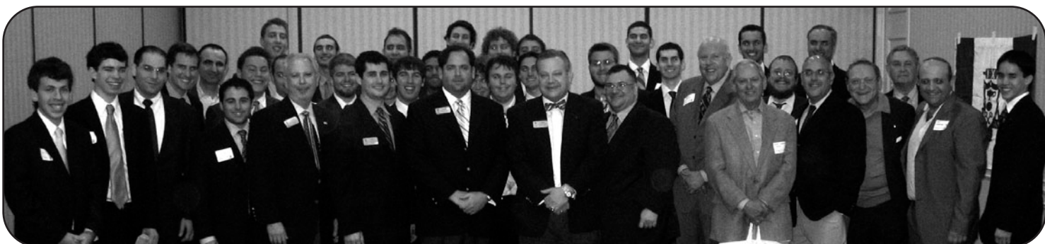
AT SOUTHERN CAL last March 30, Mu Theta chapter was reinstalled on the Los Angeles campus; pictured are the 22 neophytes and their installation team.