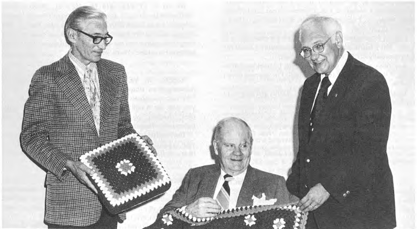
WW II 69TH INFANTRY DIVISION AUXILIARY REMEMBER VETERANS AT CANADAIGUA VA HOSPITAL