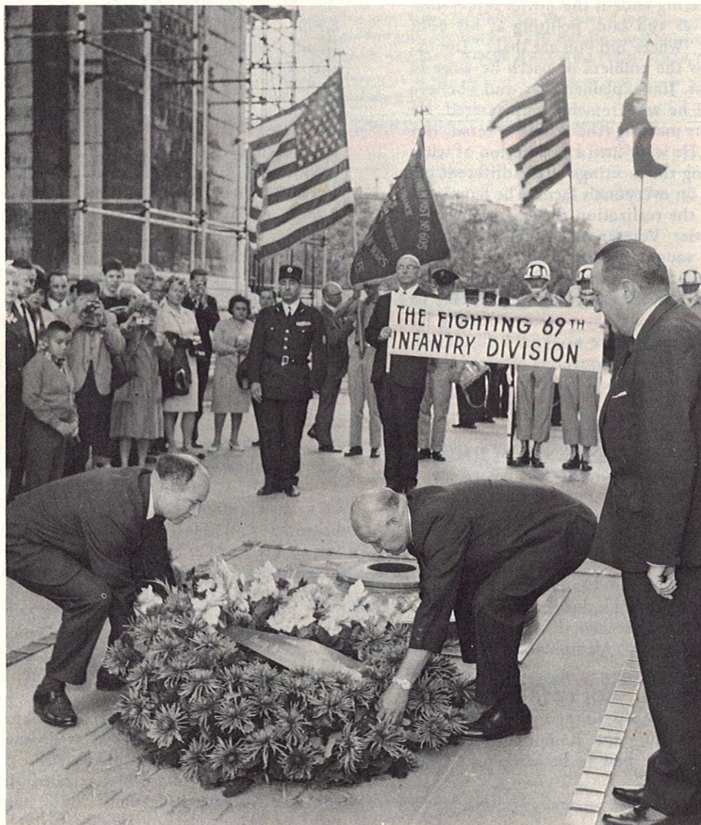
MEMORIAL CEREMONY ARC de Triomphe PARIS 1965