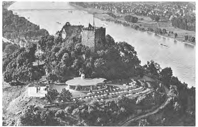
Victory Bridge March to July, 1945 Bad Niederbreisig. Burg Rheineck "photo" supplied by Member