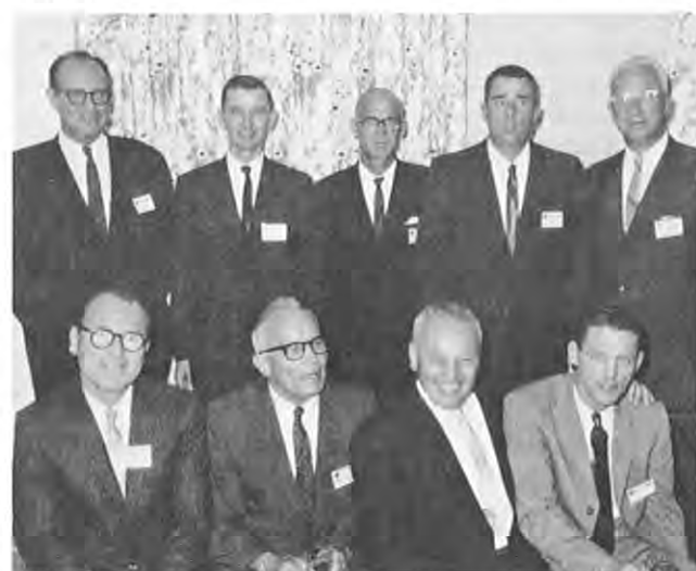
A-271 at Reunion! Where have you been?