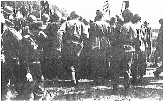
American and Russian troops meet.