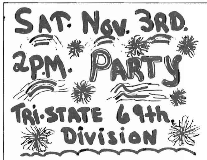
Pictured above is a copy of the sign which was posted at the Veterans Hospital in Aspinwall, Pennsylvania, announcing the events for the day, on Saturday, November 3, 1979.