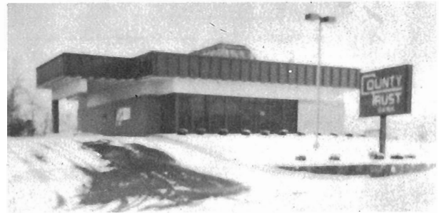
Snow covered County Trust, in Donegal, Pennsylvania.

The picture above is that of County Trust, Donegal, Pennsylvania. This is the place where our Dues Monies are deposited, for payment of the various expenses which our Fighting 69th Division Association has. These expenses being such items as: this Bulletin you are reading; Membership Rosters and changes; Postage for the Treasurer and Membership Chairman, The Sunshine Lady, and many, many more miscellaneous bills.