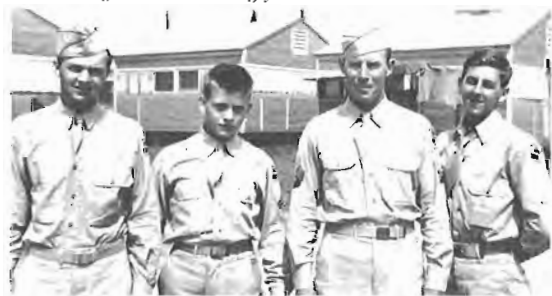
Camp Shelby, Mississippi September, 1943