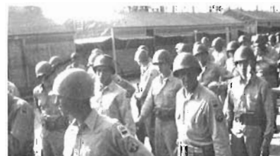
A-Company, 272nd Regiment, falling out for Parade Formation, on the First Birthday of the 69th Division.