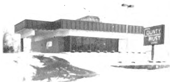
County Trust, Donegal, Pennsylvania

My final moments of a little 'chit-chat' to you, members of the great Fighting 69th Infantry Division Association. It appears to me, as we get older, we are getting stronger . . . as a nice group of young BBB's. We now have four active Groups meeting once or twice a year between Reunion week, and I do believe another two will be active, shortly. The Central Pennsylvania group had twenty at their Spring Banquet . . . down somewhat from other banquets, but this can be expected at times.