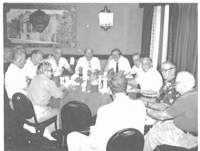
269th Engineers Hospitality Room at the New Orleans Marriott.