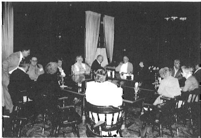
Round Table Discussion of the Tri-State Group, at Willows Motel, Industry, Pennsylvania, on May 2, 1980.