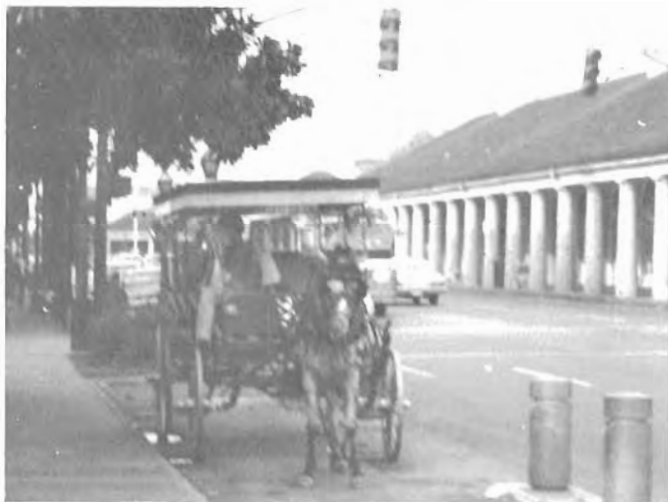
Scene from the French Quarters, New Orleans, Louisiana.