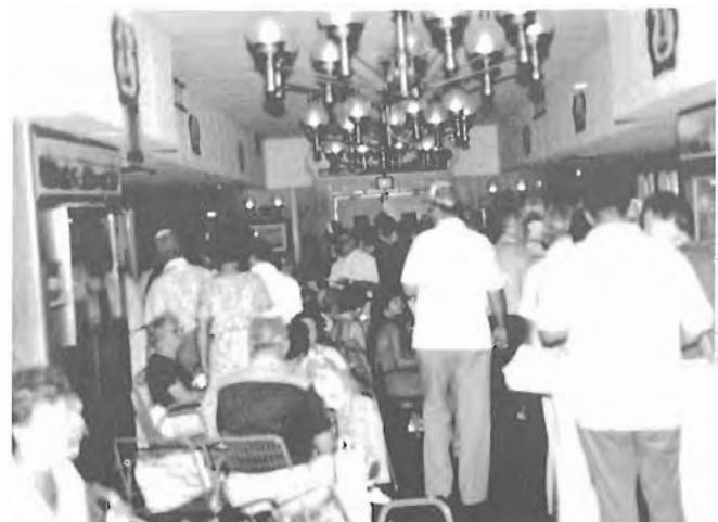
Aboard the Natchez during the Early Bird Dinner and Cruise.