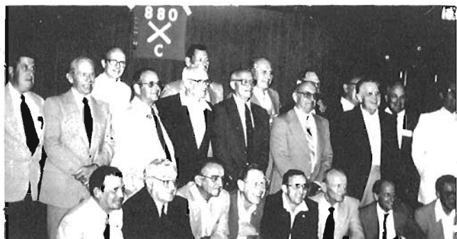
C-880th F.A. Battery