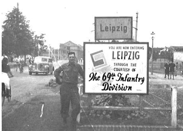
Another picture of Charles Fairchild D-369th Medics at the entrance to Leipzig.