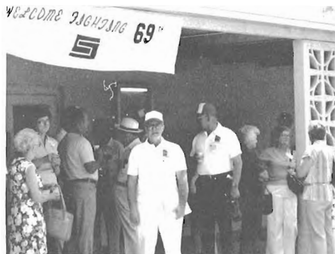
69er's in front of Dolton Hall at Camp Shelby.