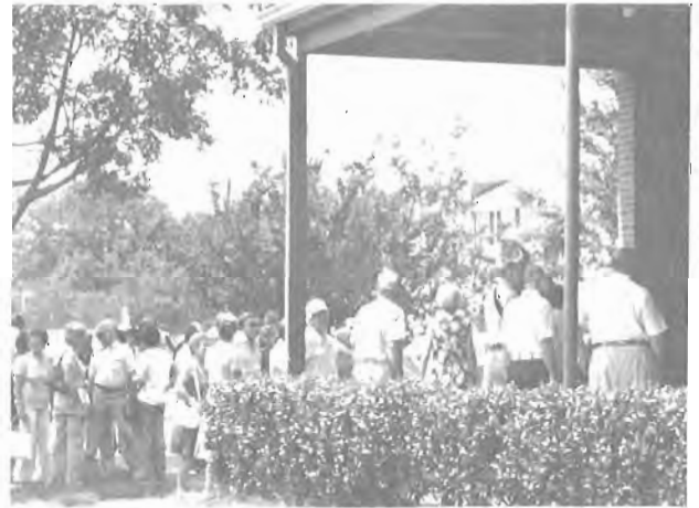
69er's gathered outside of William Carey College in Hattiesburg, prior to lunch.