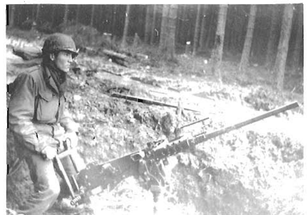
The two pictures above, were taken on the First Day of Combat, for A-Battery, 881st Field Artillery.